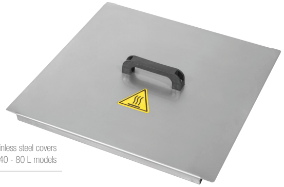
Dual layer, AISI 304 stainless steel covers between 40 - 80 L models