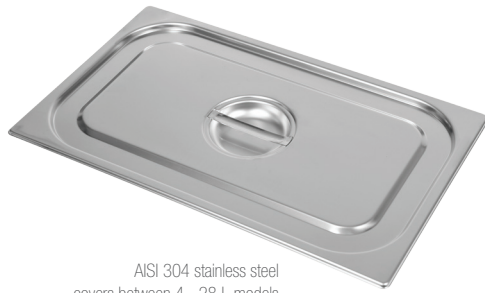
AISI 304 stainless steel covers between 4 - 28 L models