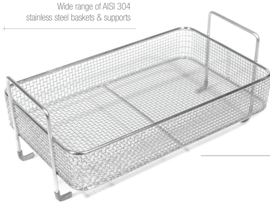
Wide range of AISI 304 stainless steel baskets & supports