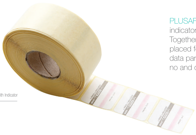
Adhesive Label Roll with Indicator

PLUSAFE series adhesive labels are available with chemical indicator for steam or ethylene oxide sterilization methods. Together with label gun, the labels can be printed and placed for improved with traceability by presenting various data parameters like sterilization date, expiry date, sterilizer no and cycle no.