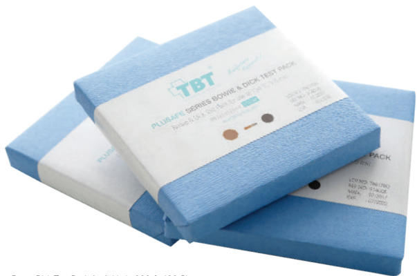
Bowie-Dick Test Pack Available in 200 & 400 Sheets

PLUSAFE Class 4 Multi- Variable Indicators for steam can be used in every pack in order to verify the steam penetration into packages. The indicator changes colour in presence of sufficient steam penetration. The economical design of dual strips makes them an affordable choice for assurance.