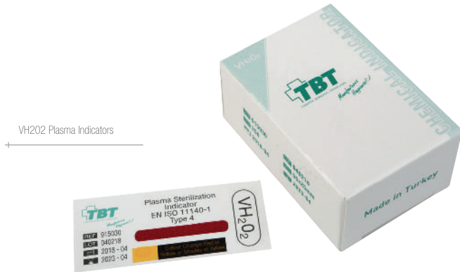
VH2O2 Plasma Indicators

PLUSAFE series adhesive labels are available with chemical indicator for steam or ethylene oxide sterilization methods. Together with label gun, the labels can be printed and placed for improved with traceability by presenting various data parameters like sterilization date, expiry date, sterilizer no and cycle no.