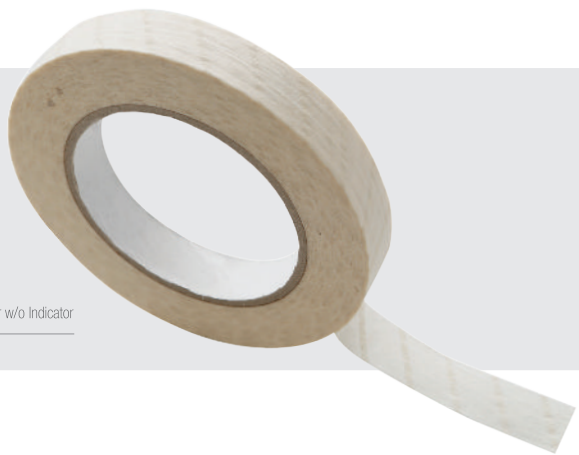
Adhesive Tape with or w/o Indicator

PLUSAFE series adhesive tapes with or without indicator provides a solution for durable closing of wrapped packages while peeling is still easy. An indicator ink printing is used for monitoring exposure of steam, EO or plasma. It is possible to have tapes without ink as well.