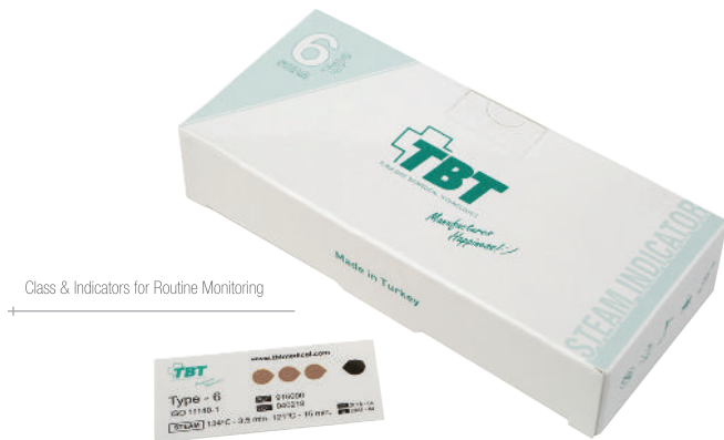
Class 5 Indicators for Routine Monitoring

PLUSAFE PCO Helix test packs are used as a daily test for pre-vacuum hospital sterilizers for steam penetration capabilities and can replace Bowie-Dick test packs. It should be used in sterilizers when mainly hollow instruments are sterilized. The PCO challenge device is made of stainless steel for long lifetime expectancy.