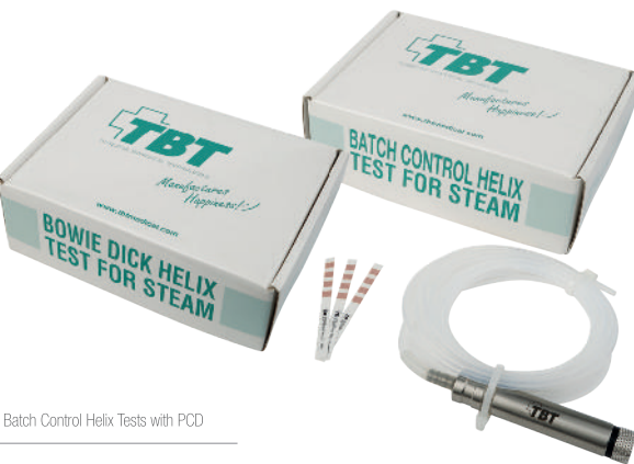
Bowie-Dick & Batch Control Helix Tests with PCO

PLUSAFE Container Registration Cards for steam are placed on the outside of sterilization containers each time the container is sterilized in order to indicate proper exposure to sterilization parameters. They give visual indication that the sterilization container has been exposed to sterilization. Cards contain space to indicate key information including sterilization date, expiry date, sterilizer number and name of operator.