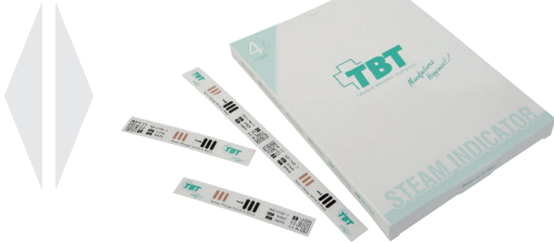
Dual Strip Design for Economy in CSSD

PLUSAFE Container Registration Cards for steam are placed on the outside of sterilization containers each time the container is sterilized in order to indicate proper exposure to sterilization parameters. They give visual indication that the sterilization container has been exposed to sterilization. Cards contain space to indicate key information including sterilization date, expiry date, sterilizer number and name of operator.