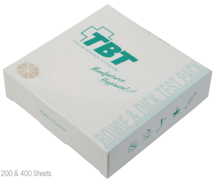
Bowie-Dick Test Box in 200 & 400 Sheets

PLUSAFE series Bowie & Dick Test Packs are designed to evaluate performance of the air removal in pre-vacuum steam sterilizers in compliance with EN 285 standards under certain parameters. An indicator sheet with water based, non-toxic chemical indicator is placed in centre of package. The test sheet's backside provides a data storage area for various parameters for recording & traceability.