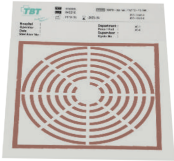
Bowie-Dick Test Sheet

PLUSAFE PCO Helix test packs are used as a daily test for pre-vacuum hospital sterilizers for steam penetration capabilities and can replace Bowie-Dick test packs. It should be used in sterilizers when mainly hollow instruments are sterilized. The PCO challenge device is made of stainless steel for long lifetime expectancy.