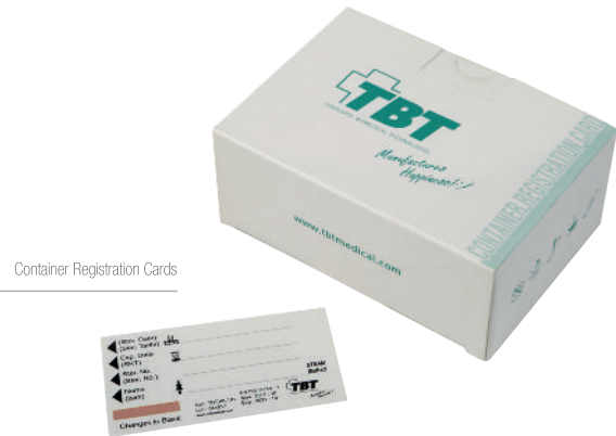
Container Registration Cards